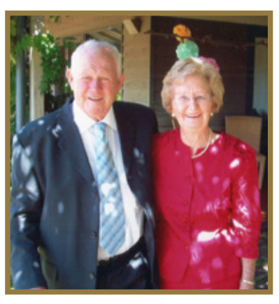
A friendly smile, A casual touch, These are the things that mean so much. To know you are with us in our time of sorrow, Sharing our prayers today and tomorrow.