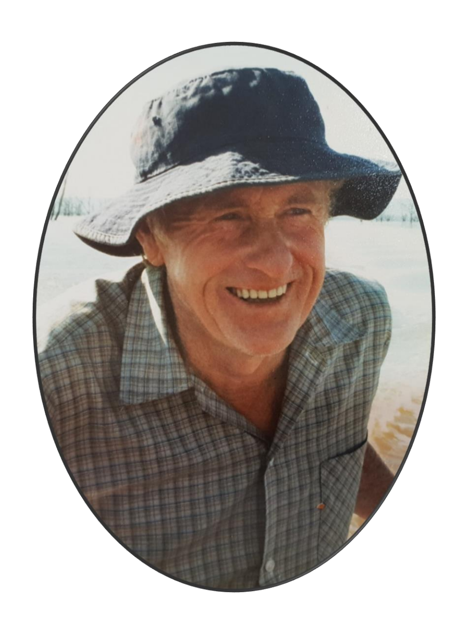
Poem - One at Rest

Think of me as one at rest, for me you should not weep I have no pain no troubled thoughts for I am just asleep. The living thinking me that was, is now forever still And life goes on without me now, as time forever will. If your heart is heavy now because I've gone away Dwell not long upon it friend, for none of us can stay Those of you who liked me, I sincerely thank you all And those of you who loved me, I thank you most of all. And in my fleeting lifespan, as time went rushing by I found some time to hesitate, to laugh, to love, to cry Matters it now if time began, if time will ever cease? I was here, I used it all, and now I am at peace