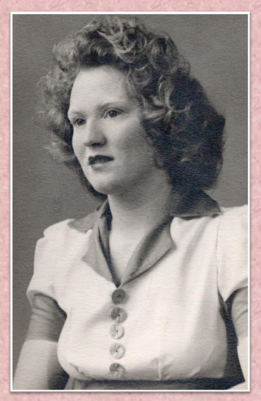
Movember 19th 1927 - Movember 24th 2018